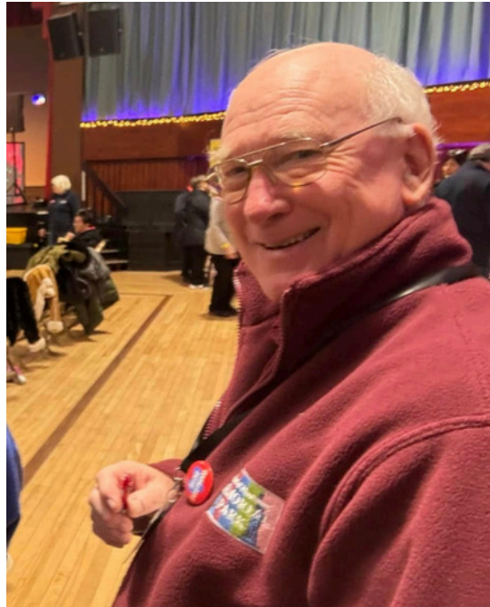
Armed Forces Champion's Volunteer of the Month – April 2026